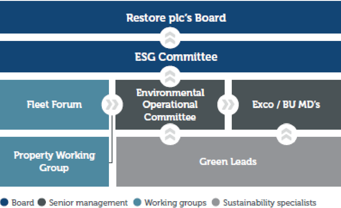
Restore plc's net zero governance structure:

Various management led committees have been integrated into the Group's governance structure as set out below. Restore Datashred is fully embedded in this structure with representatives on the Environmental Operational Committee, Exco, Fleet forum and Property Working Group.